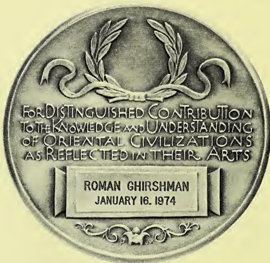
THE CHARLES LANG FREER MEDAL